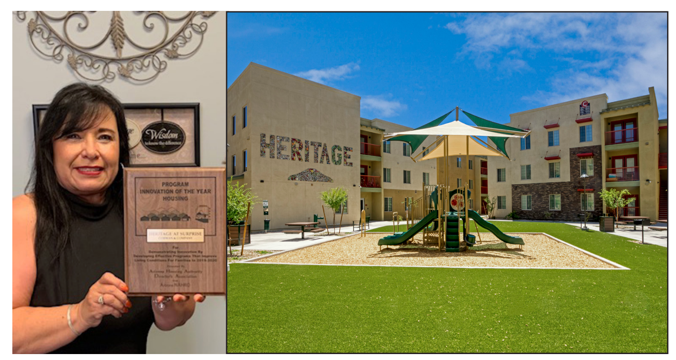
The Heritage at Surprise

2020 AZ NAHRO AWARD. The Arizona Chapter of the National Association of Housing and Redevelopment Officials (AZ NAHRO) honored the Housing Authority of Maricopa County (HAMC) the Innovative Program of the Year Award for its newly completed housing project, the Heritage at Surprise.