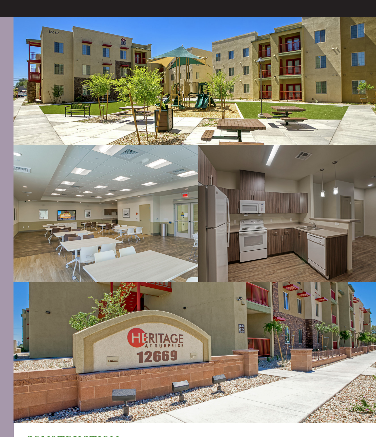
CONSTRUCTION on the Heritage at Surprise was completed in 2020, creating 100 brand new apartment units in the west valley.